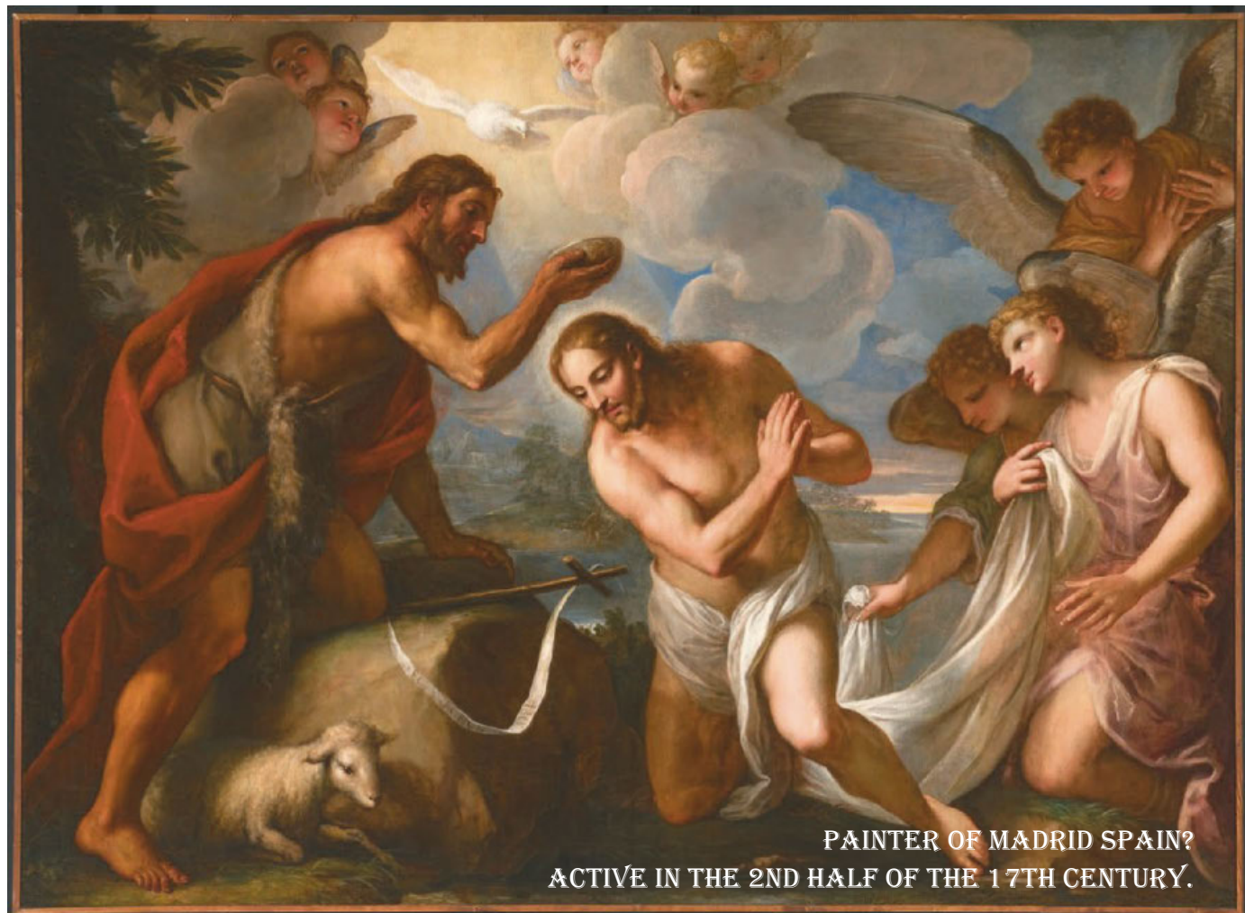
PAINTER OF MADRID SPAIN? ACTIVE IN THE 2ND HALF OF THE 17TH CENTURY.