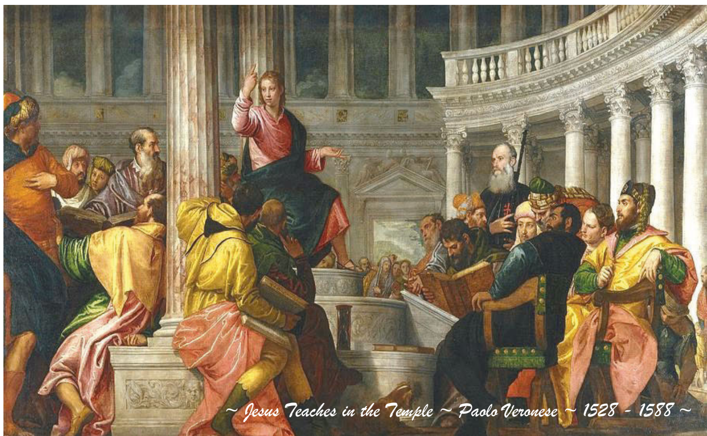
~ Jesus Teaches in the Temple ~ Paolo Veronese ~ 1528 - 1588 ~